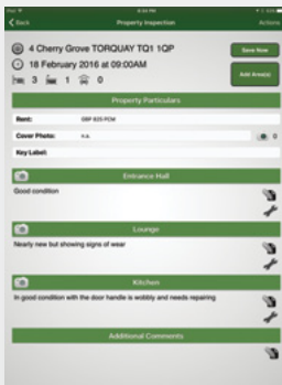
Rentfind Inspector App